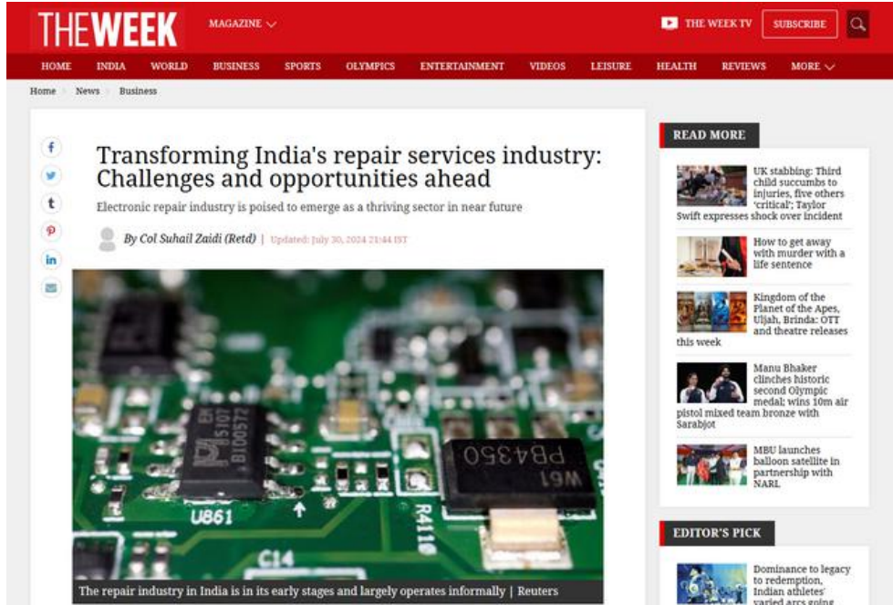
The Week, 30 July 2024