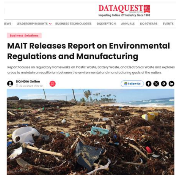
Dataquest Magazine, 22 July 2024